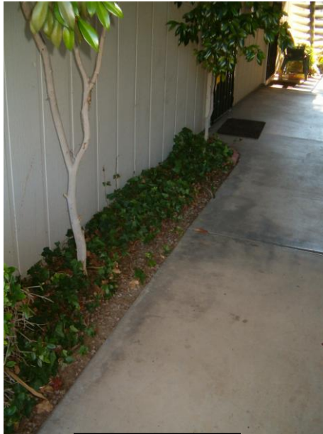
Bldg 3097(2) Breezeway