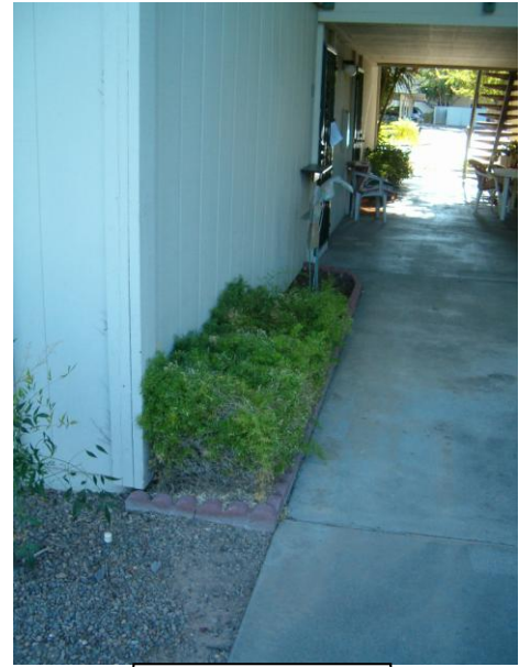
Bldg 3035 Breezeway