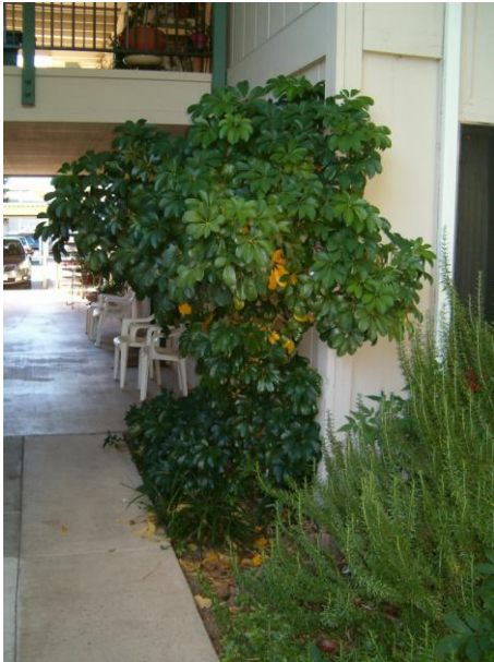
Bldg 3005 Breezeway