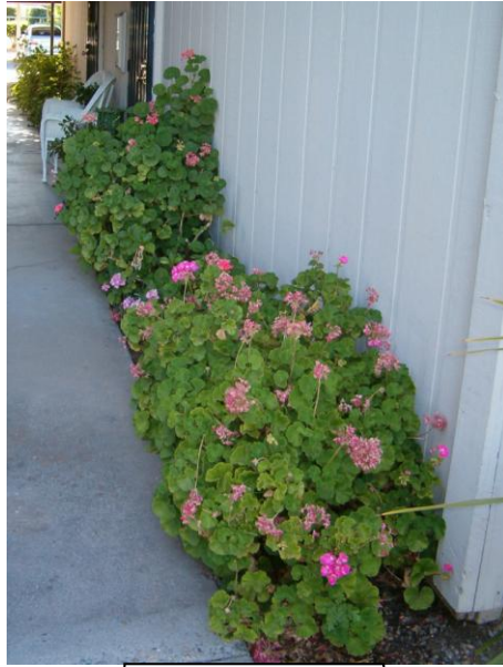
Bldg 3037(2) Breezeway