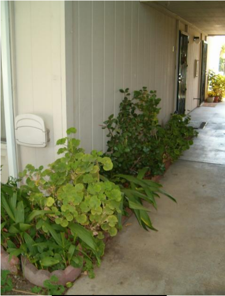
Bldg 3037 Breezeway