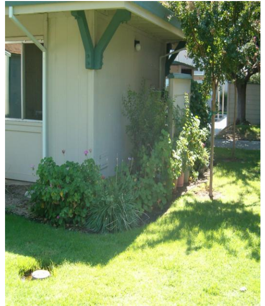
Laundry Room Southside