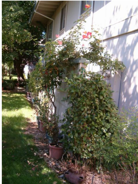
Bldg 3005(2) Southside of Bldg