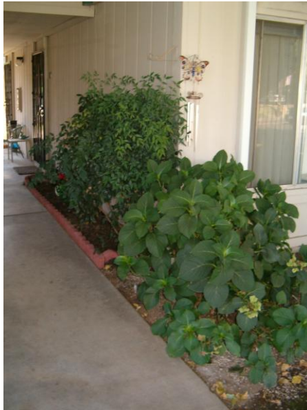
Bldg 3087 Breezeway