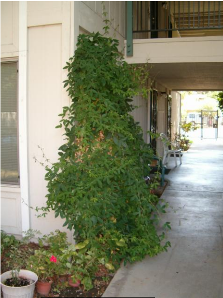
Bldg 3097 Breezeway