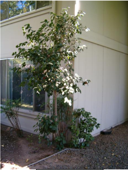
Bldg 3075 Breezeway